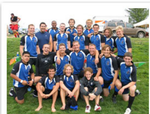
A BILINGUAL TOUR MANAGER WILL BE WITH YOUR TEAM AT ALL TIMES

✓ Training facilities, game fields, and training equipment.