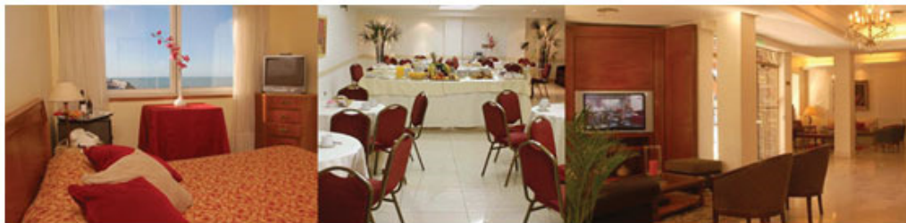
HOTEL GUERRERO, MAR DEL PLATA.