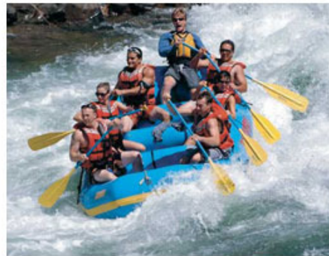
WHITewater RAFTING IN MENDOZA.