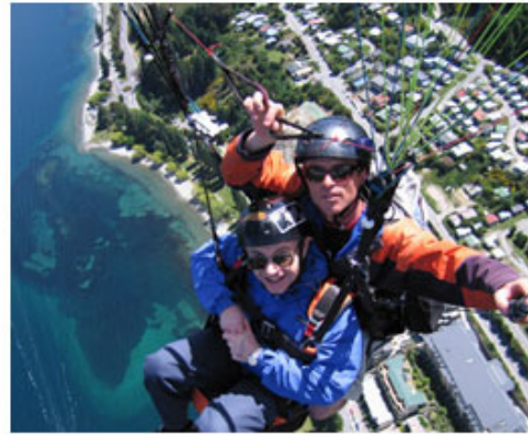
PARAGLIDING IN MENDOZA IS THE ULTIMATE ADRENALINE RUSH.

✓ 4 nights at the Cristoforo Colombo Hotel in Buenos Aires ( http://www.torrecc.com/ingles/ ) with swimming pool and fitness room. This hotel is located in the premium and safest area of Buenos Aires (Barrio Parque) and it's only two blocks away from the American Embassy. 4 nights at the Hotel Guerrero in Mar del Plata ( http://www.hotelguerrero.com.ar/ ), which is also in a very safe area and has top-of-the-line amenities and incredible views of the Atlantic Ocean. 2 nights at the Gran Hotel Mendoza ( http://www.hotelmendoza.com/ ). The remaining two nights are spent on overnight bus rides. The buses are so comfortable that most players prefer them over real beds. No kidding.