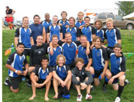
A BILINGUAL TOUR MANAGER WILL BE WITH YOUR TEAM AT ALL TIMES

✓ Some optional activities. The Buenos Aires City Tour, the Mar del Plata City Tour, and the Mendoza City Tour are included in the tour price. All