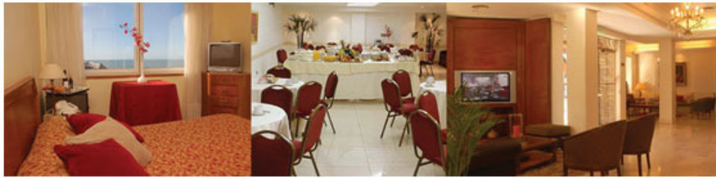
HOTEL GUERRERO, MAR DEL PLATA.

✓ Transfers to/from the airport, to/from the games, and to/from practices. It also includes the round trip bus between Buenos Aires and Mar del Plata. During the 5 days in Mar del Plata, the bus will be available for the team 24/7.