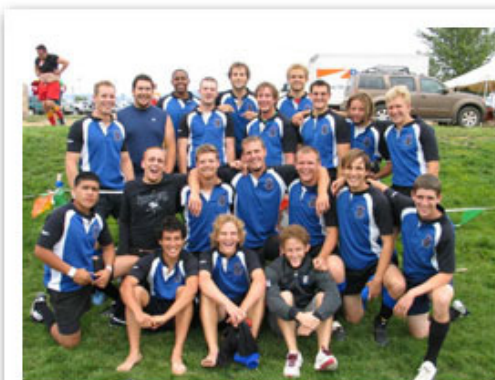
A BILINGUAL TOUR MANAGER WILL BE WITH YOUR TEAM AT ALL TIMES

✓ Training facilities, game field, and training equipment.