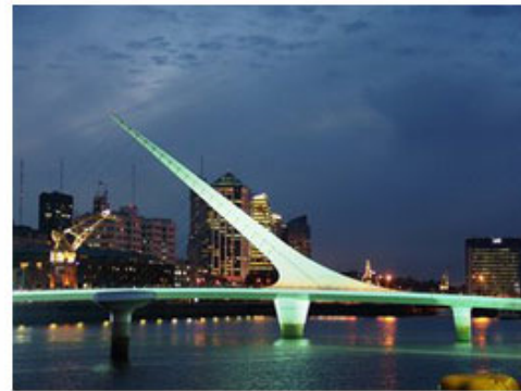
Buenos Aires at night. No wonder why they call it "The Paris of South America"

Finish the day with a short visit to Recoleta, the neighborhood of choice for expats in Buenos Aires to have a good time and eat at the best restaurants.